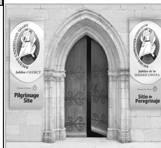
Jubilee Pilgrimage Churches for the Diocese of Austin

In this exciting Jubilee Year, the Diocese of Austin invites you to discover the many ways of receiving, understanding, and sharing God's great mercy. On the website you will find all sorts of resources and information for yourself, your family, and your parish.