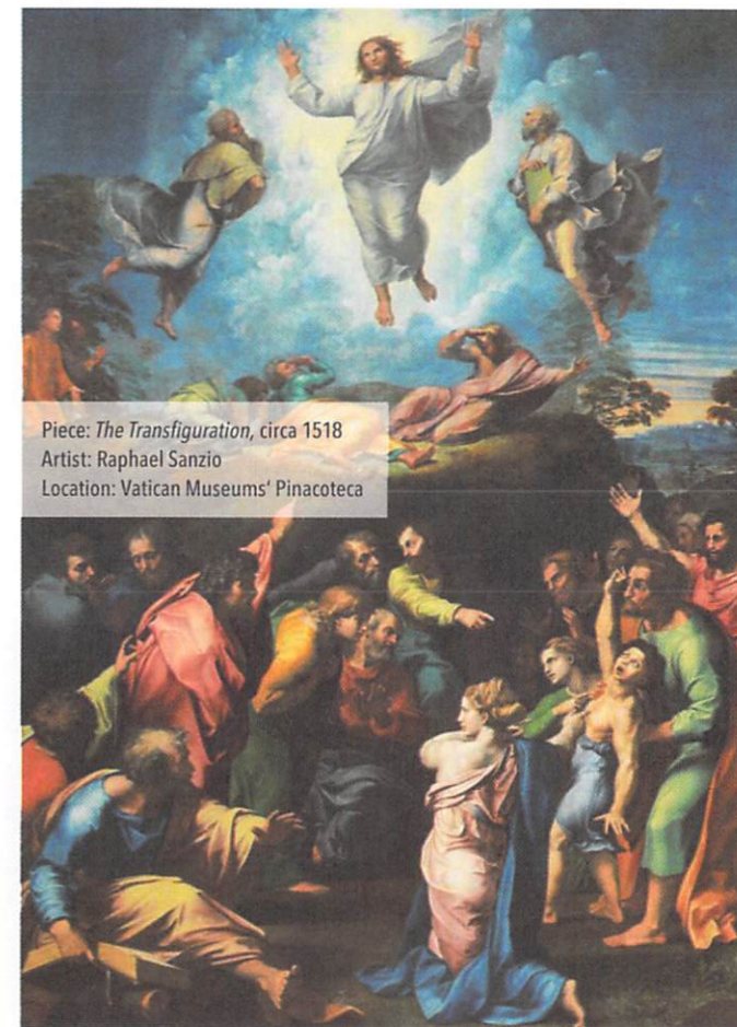
Piece: The Transfiguration , circa 1518 Artist: Raphael Sanzio Location: Vatican Museums' Pinacoteca