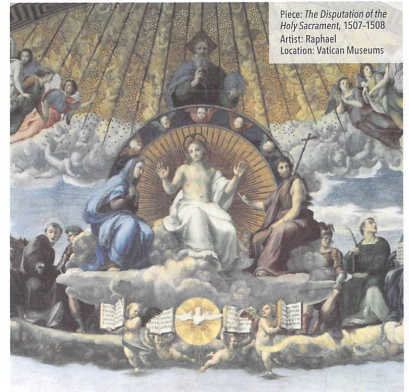
Piece: The Disputation of the Holy Sacrament , 1507–1508 Artist: Raphael Location: Vatican Museums

Yet, his absolute authority doesn't convert him into an aloof despot. God lovingly takes interest