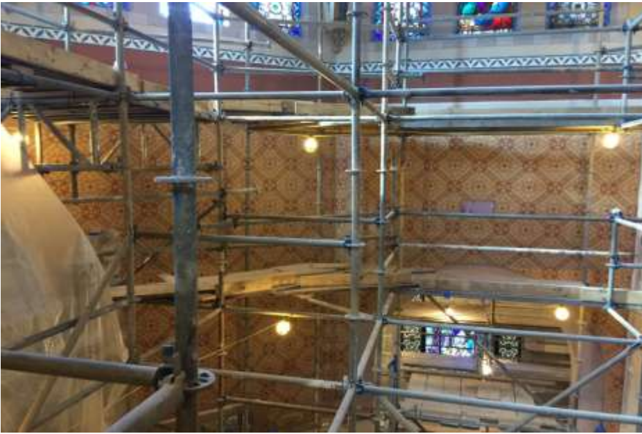
Here's a close up.