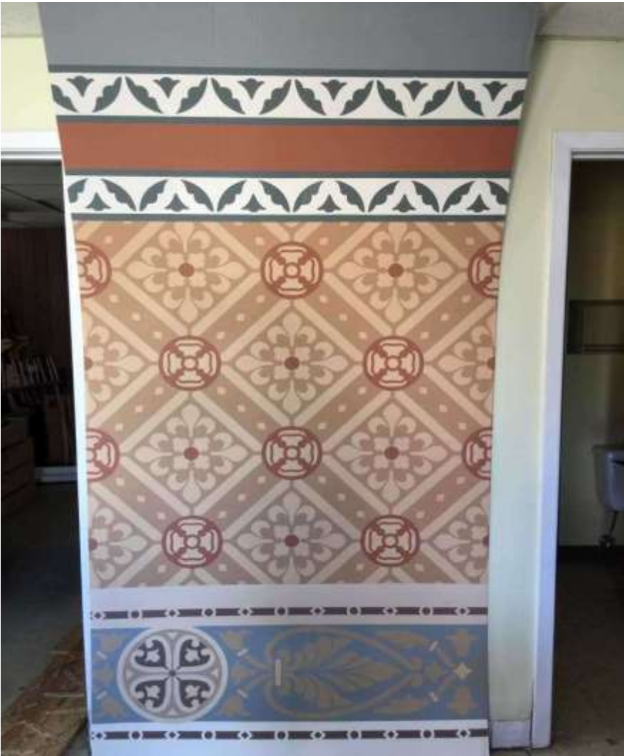
Here's the color scheme and design patterns for the apse wall.