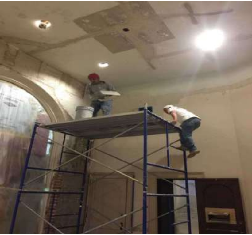
The sacristy is now being replastered.