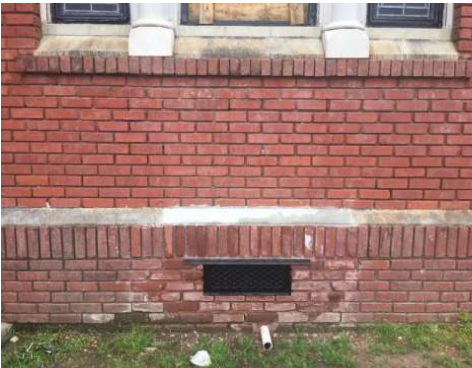
The through wall vents at the perimeter of the Cathedral are now closed up, and the historical look of the prior vent openings from the exterior is retained. This would solve many problems such as: reduce maintenance work, prevent further spalling of the underside of the concrete floor reinforcing, extinguish the need for cost of ductwork replacement, and condition the crawl space expelling unwanted moisture.