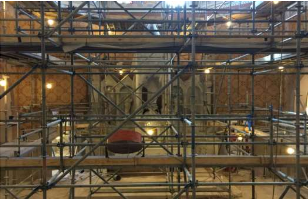
The apse wall behind the high altar is now painted.