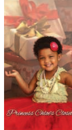
Princess Chloe's Closet

princesscloescloset@yahoo.com princesscloescloset.storenvy.com