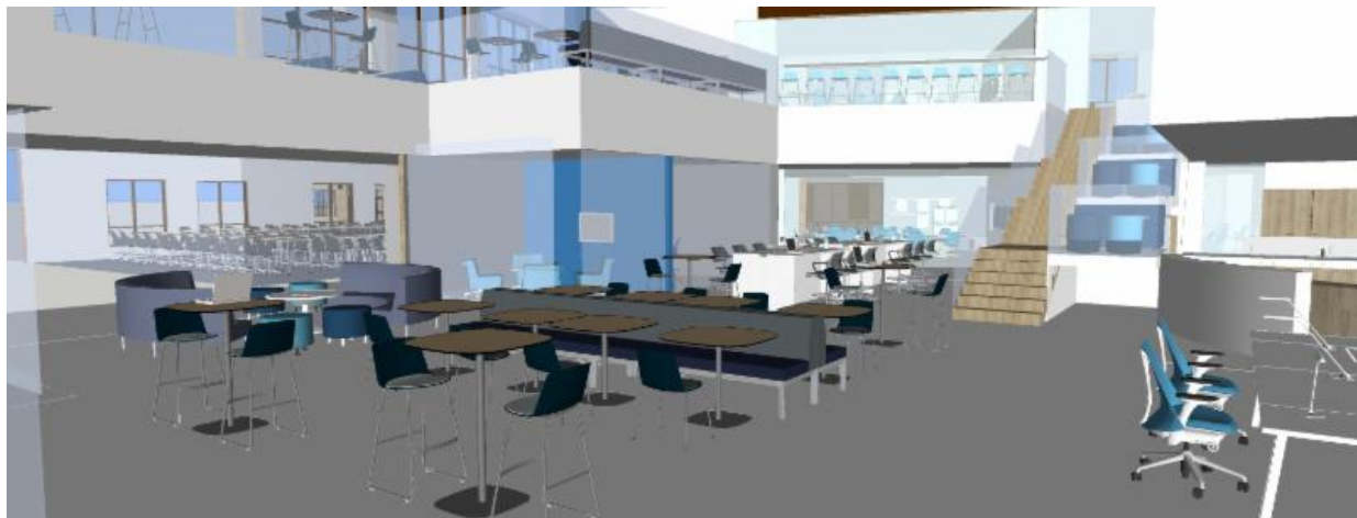
New SMCHS Student Life Center