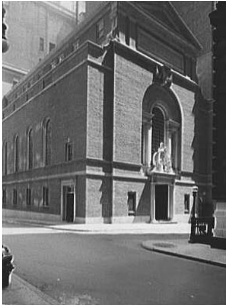
Church of Our Lady of Victory 60 William Street 212-422-5535