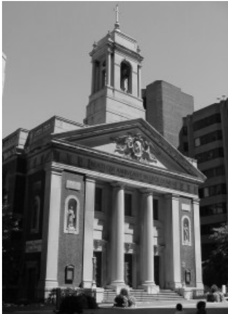
Church of Saint Andrew 20 Cardinal Hayes Place 212-962-3972