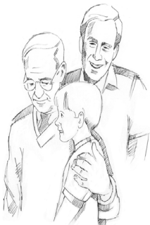
Happy Father's Day

Happy Father's Day to all. As we celebrate Father's Day, we remember all those men and fathers who have not been recognized enough in the past, many of whom are deceased, but will live in our memory for so much accomplished and so much sacrificed. We recognize those fathers who lost their