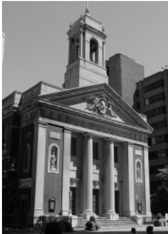
Church of Saint Andrew 20 Cardinal Hayes Place NY, NY 10007 PH: 212-962-3972