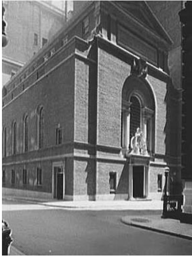
Church of Our Lady of Victory 60 William Street NY, NY 10005