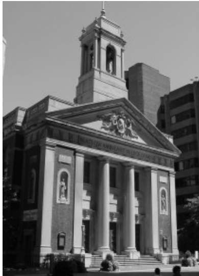
Church of Saint Andrew 20 Cardinal Hayes Place NY, NY 10007