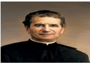
Saint John Bosco

Give online at www.seattlearchdiocese.org/nwcc