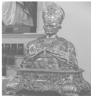
The Shrine Church of The Most Precious Blood is The National Shrine of San Gennaro

Everyone is welcome to attend any/all of these Masses. Please join us.