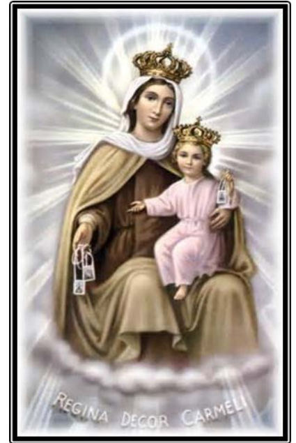
Queen and Beauty of Carmel” Pray for Us

Look us up on our website: www.olmcwharton.org