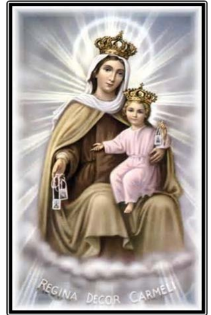
“Queen and Beauty of Carmel”