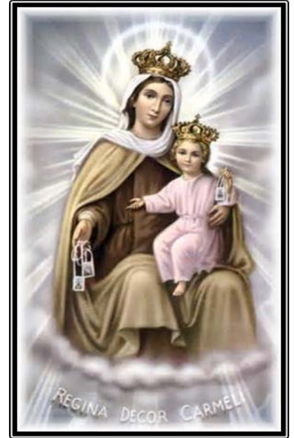
“Queen and Beauty of Carmel”