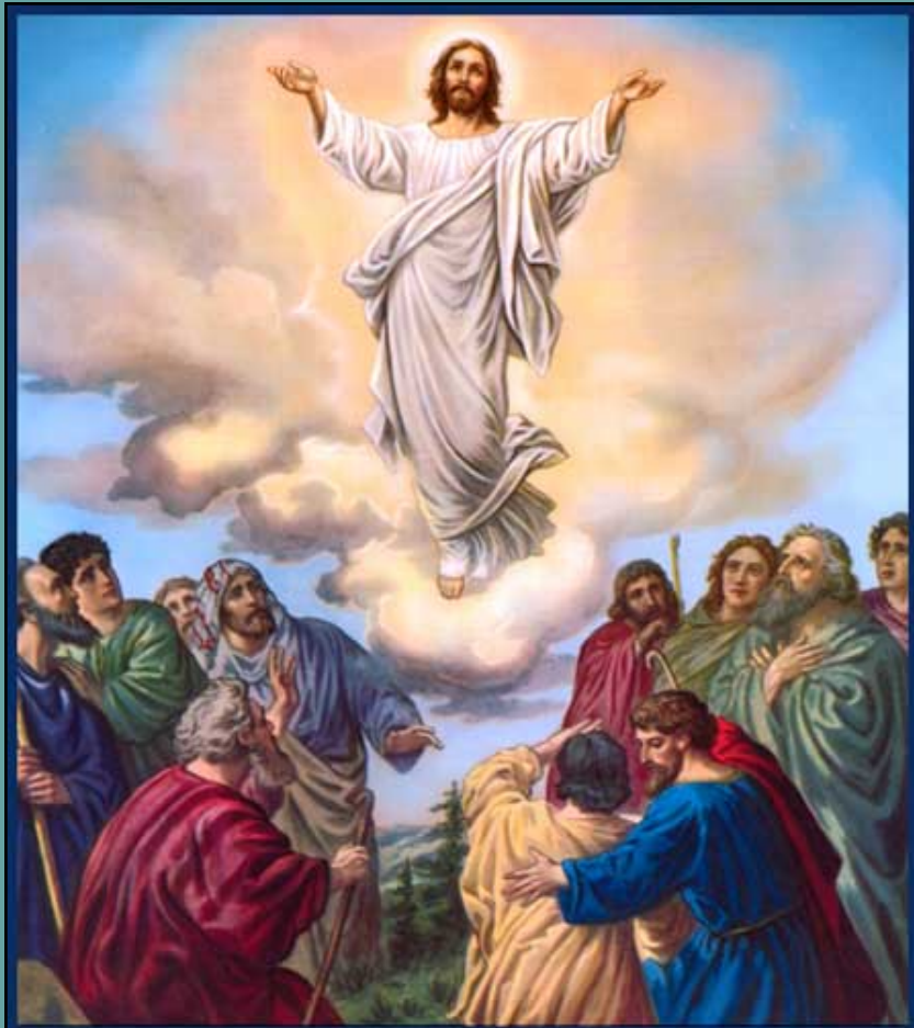
The Ascension of the Lord