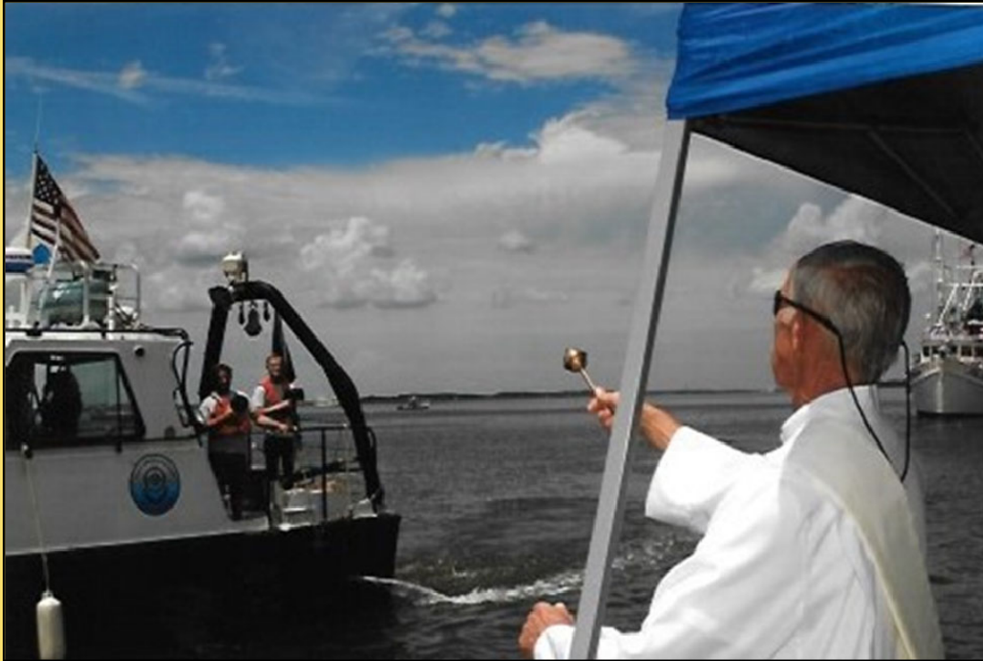
Blessing of the Fleet – Sunday, May 6, 2018 – Shrimp Fest