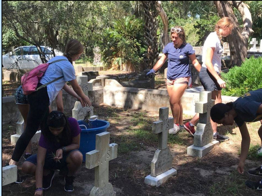
BOSQUE BELLO CEMETERY WITH GIRLS FROM ST. CATHERINE OF SIENNA GIRL'S SCHOOL IN MICHIGAN