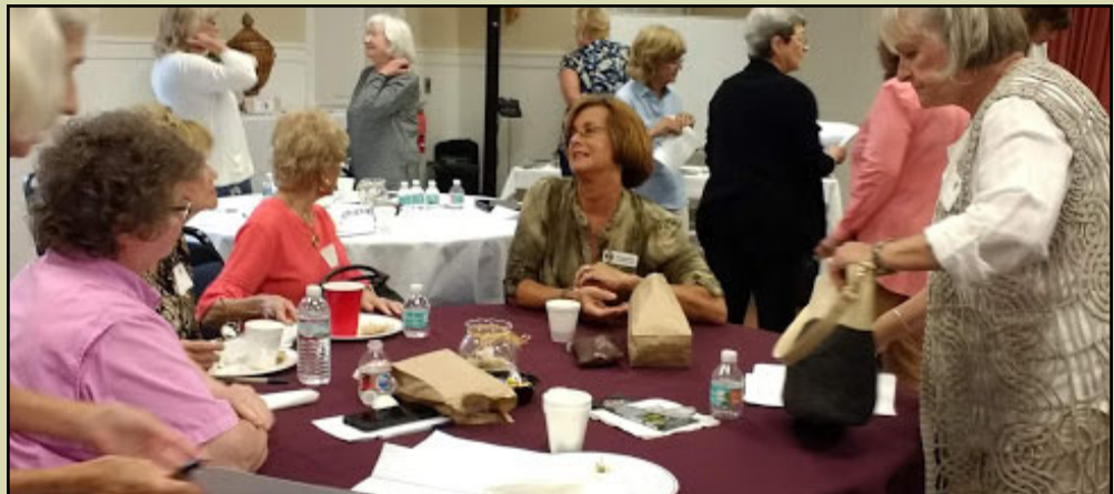
ST. MICHAEL RESPECT LIFE AND HEALTH MINISTRY "END OF LIFE ISSUES" HOSPICE CARE AND HOW TO PREPARE