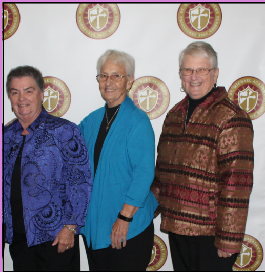
DOMINICAN SISTERS WHO GAVE LEADERSHIP TO THE ACADEMY