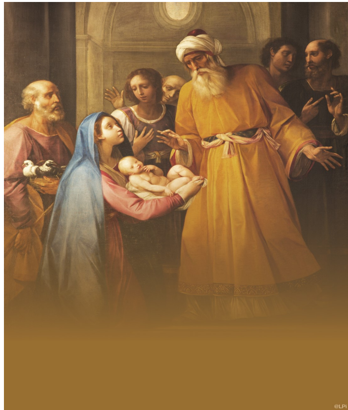
The Most Holy Family