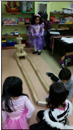
The children are building a ramp to see how far and fast the cars will go in their race track.

OPEN HOUSE - November 11 th for the Academy, Pre-school through grade 8. Parents are invited to visit the school and learn about our programs from 9:00 – 11:00 A.M. and 7 – 8 P.M. If you cannot make either of these times, please call 973-887-6990 and we will make arrangements for you to visit at another time.