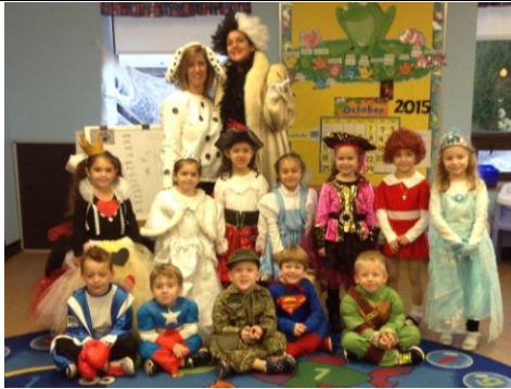
Miss Lorie's class dressed up and ready for their Halloween parade