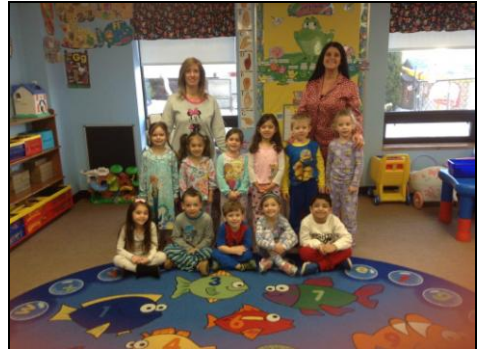
Miss Lorie's class takes a break from pajama day festivities to pose for a picture.