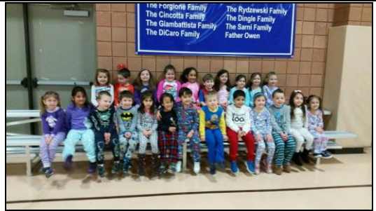
The pre-k class started Catholic Schools Week with pajama day. They watched a movie and had hot chocolate.