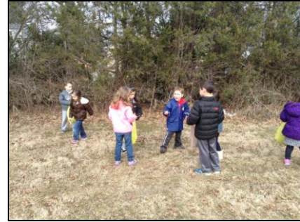
Collecting sticks and leaves for their bird nest.