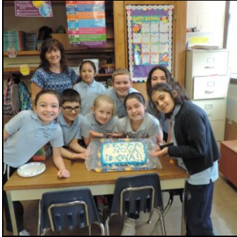
Students in grade four celebrated the end of Terra Nova testing with a "Terra Nova is Ova" cake.