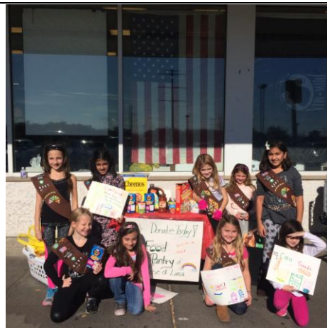
Girl Scout Troop #6331 collected food at the Parsippany Shoprite for the St. Rose Food Pantry

Finally, after a long flight back to the United States, about nine and a half hours, we arrived back in New Jersey, tired but spiritually filled and renewed. Yes, we want to go back, but, in the meantime, we will remember and treasure the memories and friendships we made that will last a lifetime.