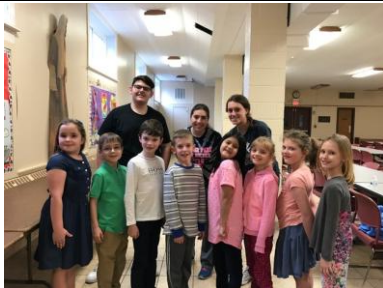
Pictured here are 10th Grade Confirmation students assisting 2nd graders at the 2nd Grade Retreat on February 25th.