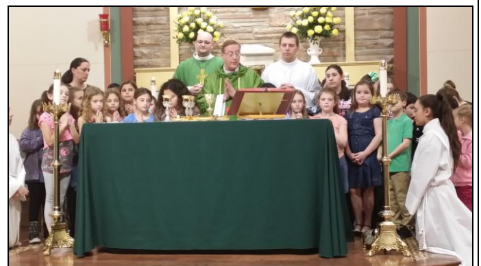
Second grade children at Mass after their retreat.