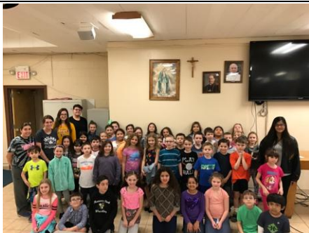
Pictured here are 10th Grade Confirmation students assisting 2nd graders at the 2nd Grade Retreat on February 25th.