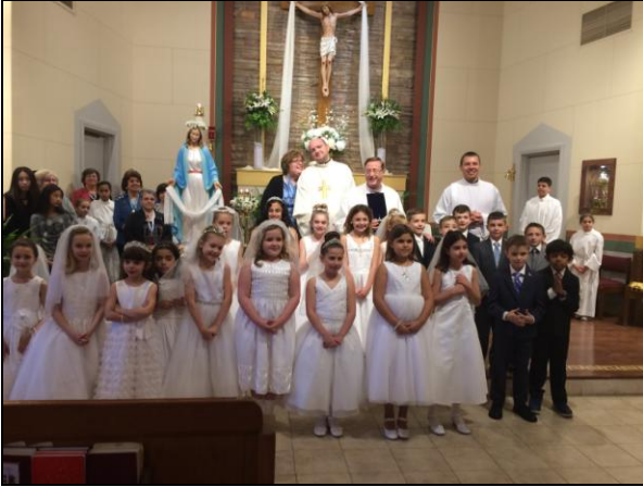
May Crowning 2017.