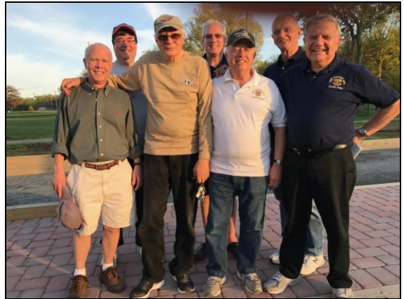
The St. Rose Knights of Columbus play Bocchi!

Drawing on June 17th at Mass in the Park. For tickets contact Neale Baxter at 973-809-7253.