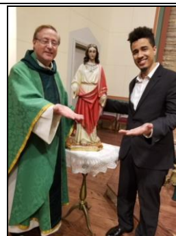
Christ invites us "To Be His Hands."