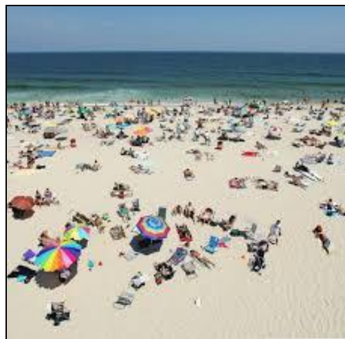
In the morning, Lord, you hear my voice; in the morning I lay my requests before you and wait expectantly.