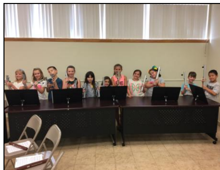
Our Summer music camp was this past week. The children learned handchimes, recorders and music theory. They also sang at the 9 am Mass for the Feast of the Assumption; congratulations to our little musicians.