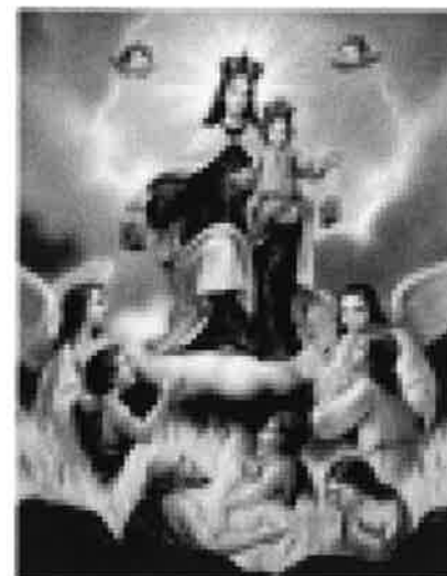
+Our Lady of Mount Carmel+ Pray for us!

Read about him here: https://catholicsaints.info/saint-camillus-of-lellis/ or here https://www.catholicculture.org/culture/liturgicalyear/calendar/day.cfm?date=2018-07-18