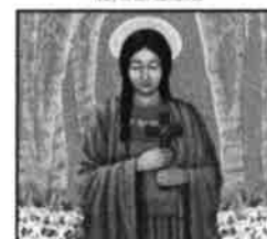
Truth to Inspire Series Saints: Kateri Tekakwitha