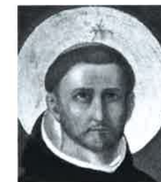
+St. Dominic ~ Pray for us+

St. Clare of Assisi: August 11, read about her at https://www.franciscanmedia.org/saint-clare-of-assisi/