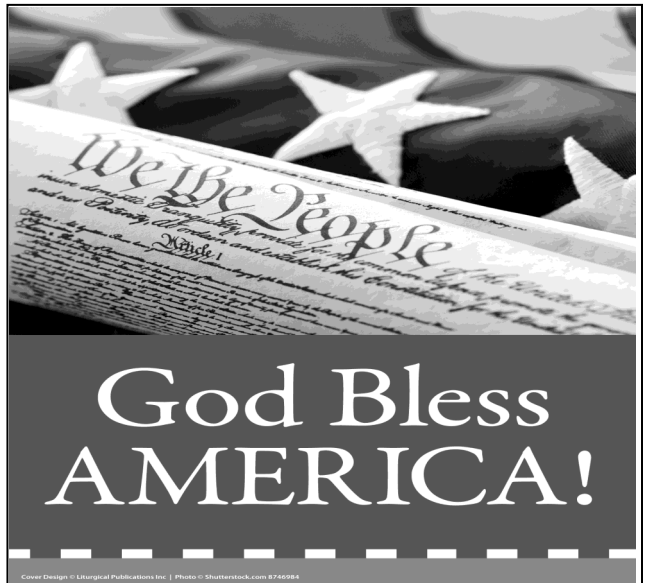
Cover Design © Liturgical Publications Inc.

Sat 6/30 4:30pm Sun 7/01 8:00am 10:30am Richard "Dick" Tibaudeau by family Mon 7/02 9:00am Emerenciana & Marcial Yandoc by family Tue 7/03 9:00am Wed 7/04 9:00am Sat 7/07 4:30pm Sun 7/08 8:00am 10:30am