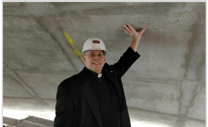
(story on next page)