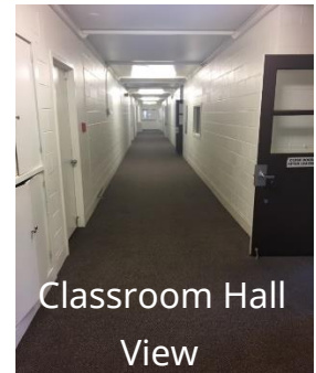
Classroom Hall View