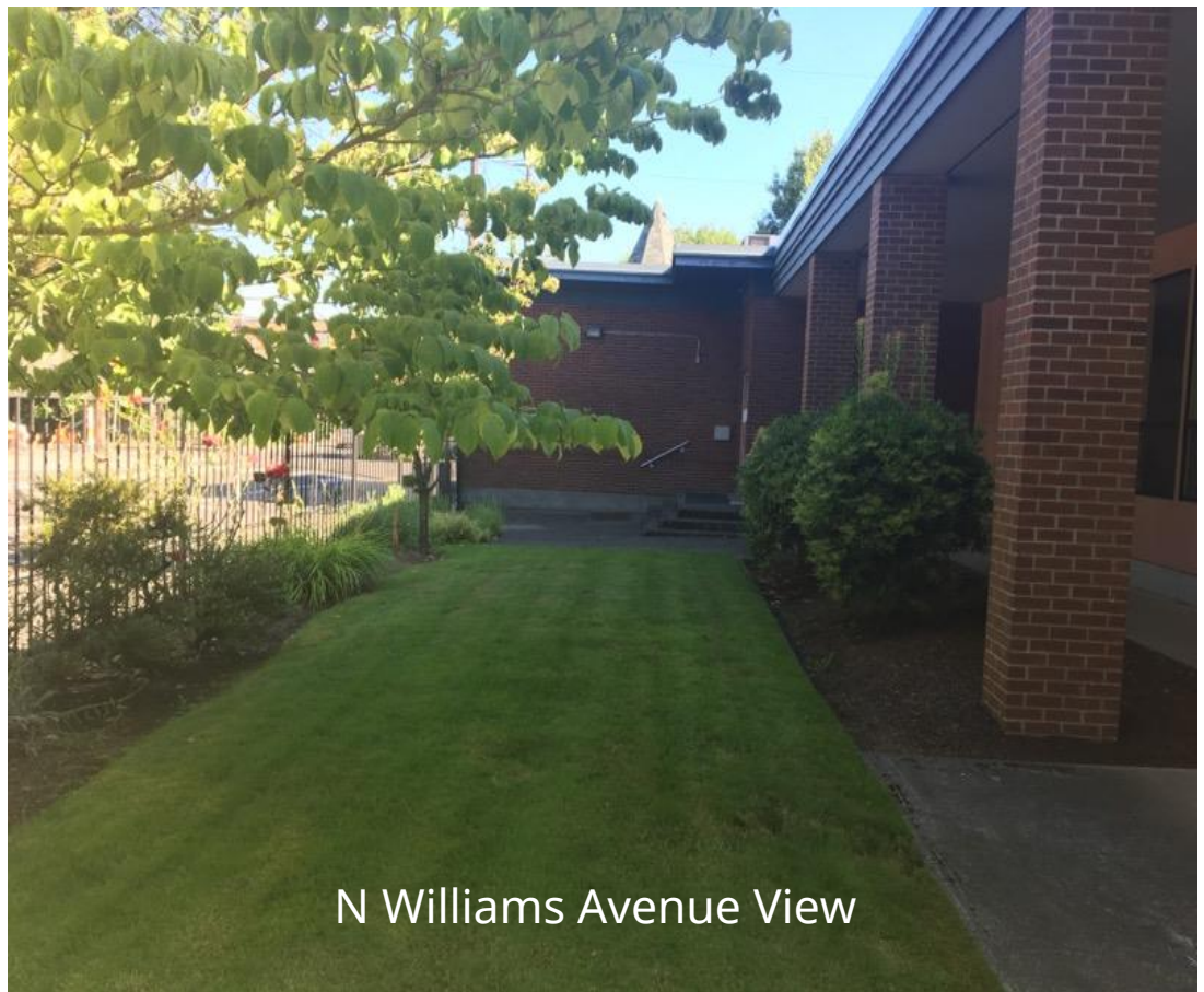
N Williams Avenue View

Year Built: 1967 4 Classrooms 2 Offices Approx. 7,500 sq. ft. Forced Air Heat Air Conditioning 2 large bathrooms 1 handicap bathroom Approx. .25 acre Fenced yard Utilities not included