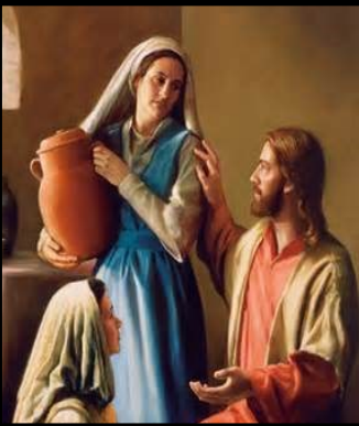
Jesus visits Martha and Mary Luke 10:38-42

JULY 17, 2016 SIXTEENTH SUNDAY IN ORDINARY TIME