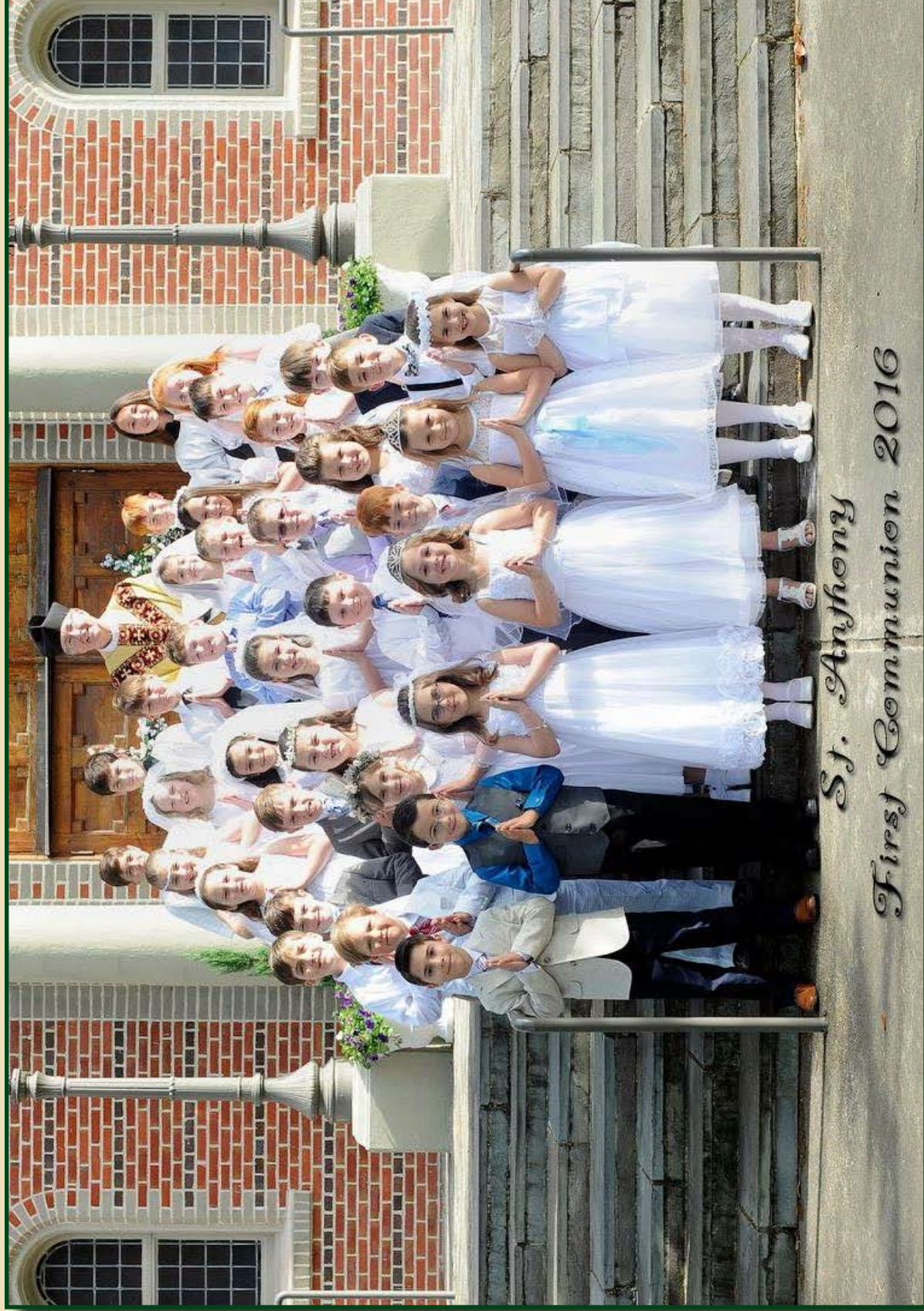
St. Anthony First Communion 2016