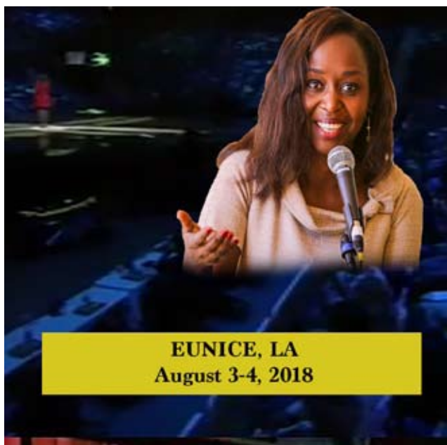
EUNICE, LA August 3-4, 2018