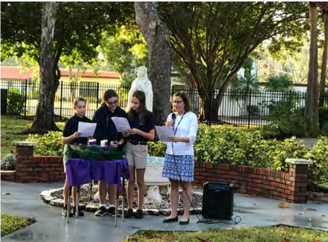
Advent Reflection Before School