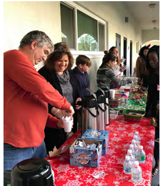
Cookies with Santa and the Book Fair