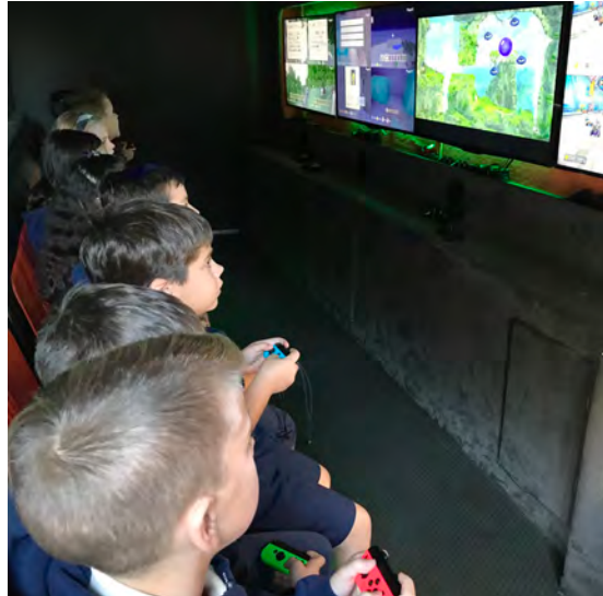
Students had fun at the Game Trailer with games inside and out!