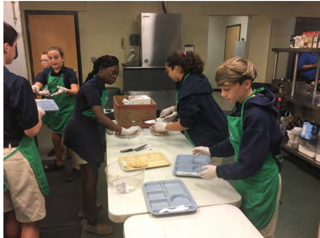
7 th Grade Service Retreat at Social Agencies