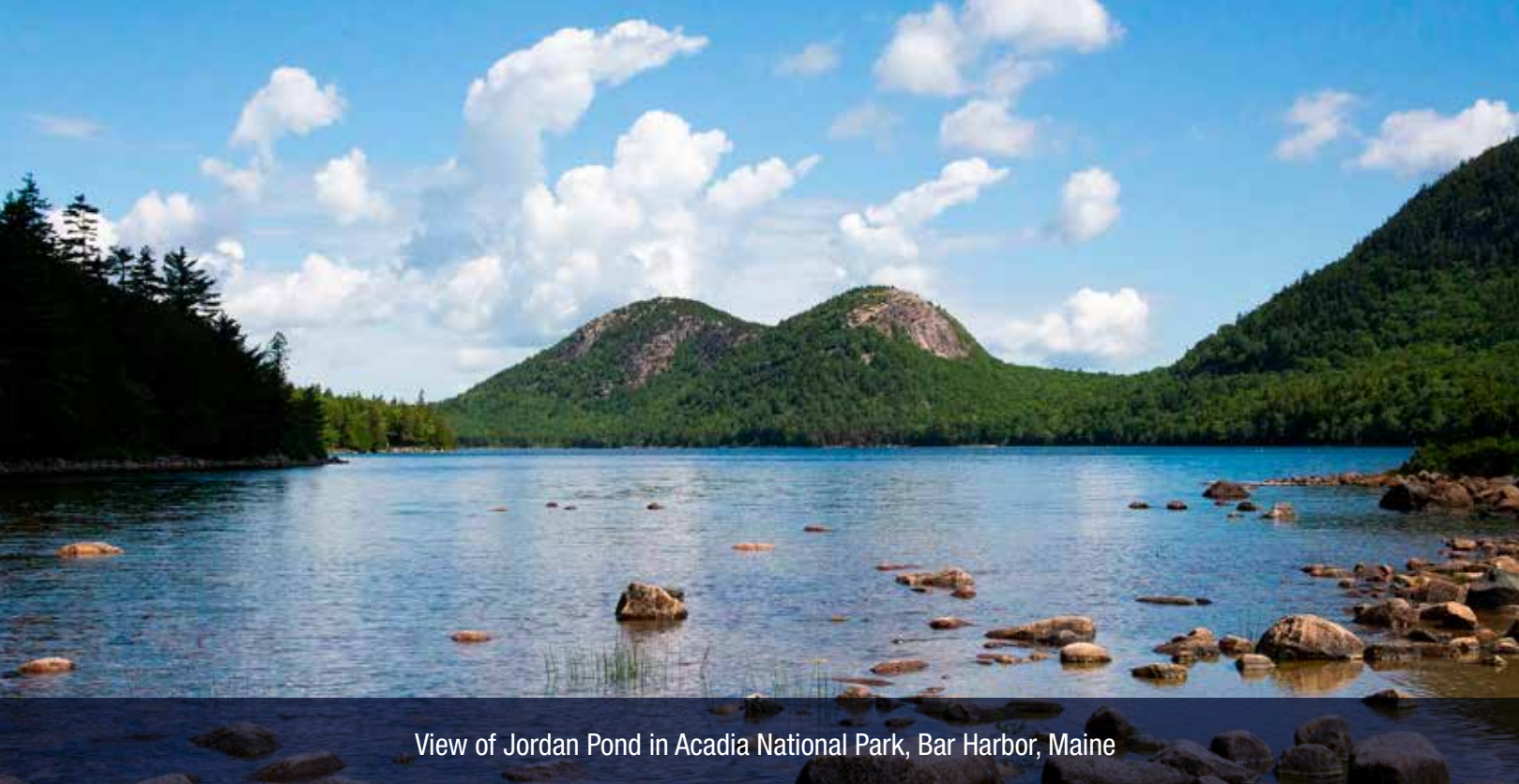
View of Jordan Pond in Acadia National Park, Bar Harbor, Maine