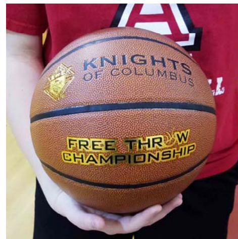
The winner in each age group received a specially-inscribed K of C basketball