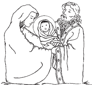
Nativity of the Blessed Virgin Mary

The Sisters of Carondelet are selling tickets for a Vacation Trip for 2 to Maui (includes roundtrip from LAX for two, 8 days, 7 nights at Royal Lahaina Resort, $300 credit at selected resort restaurants, two complimentary $108 value/person luau tickets.) The Second Prize is $1000 and Third Prize is $500. Tickets are 12 for $50 or $5.00 per ticket. Drawing will be held on October 4. Winners need not be present. To purchase tickets, call Sr. Judy at 925-331-7264 or online at www.csjla.org .