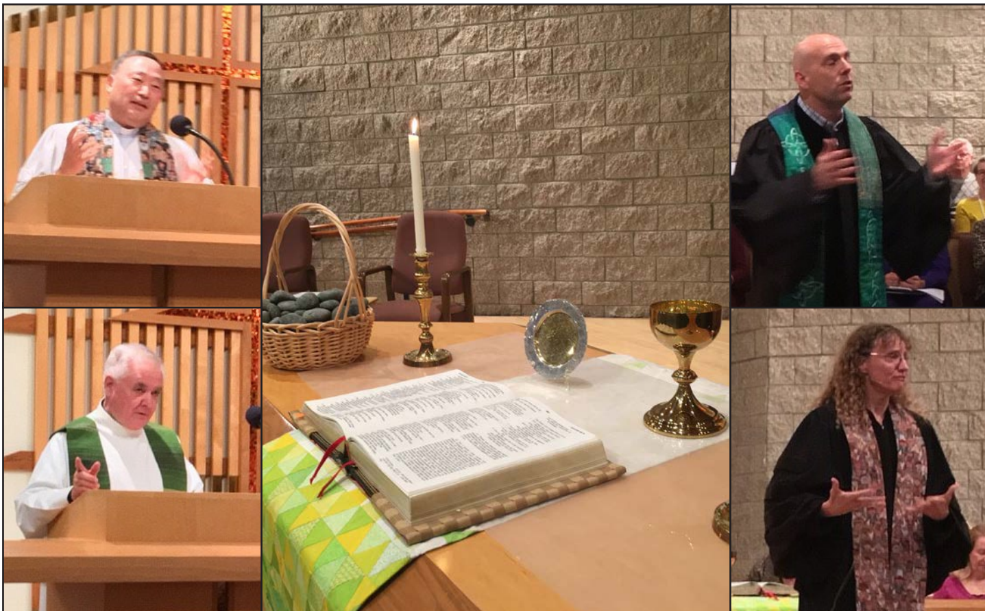
Pastors give their reflections at the recent Prayer Service for Christian Unity.