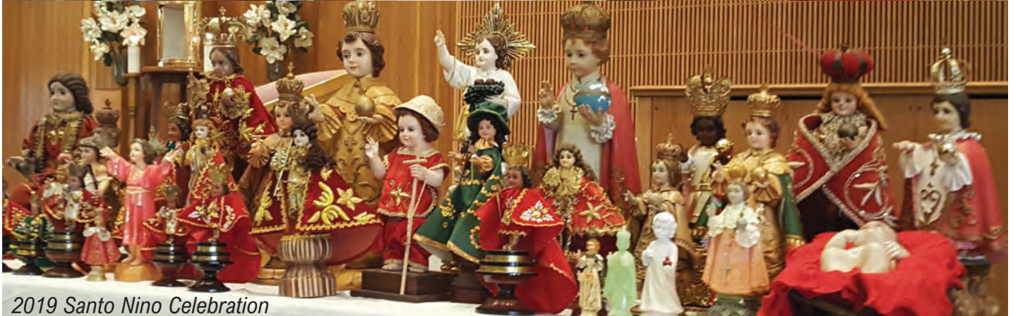
2019 Santo Nino Celebration

Second Sunday in Ordinary Time Segundo Domingo del Tiempo Ordinario