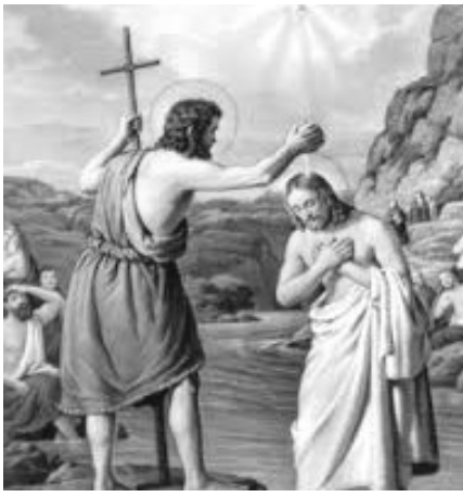
Baptism of Jesus “You are my beloved Son. On you my favor rests.” Luke 3:22