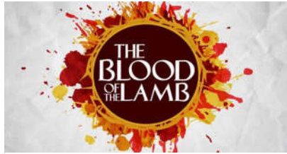
This Photo by Unknown Author is

From the Jerusalem Catechesis (Cat. 22, Mystagogica 4, 1. 3-6. 9: PG 33, 1098-1106)