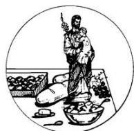
St. Joseph Table

Our Annual St. Joseph's Table will be held on Sunday, March 17. Anyone who would like to help in any capacity be it serving, baking etc. is surely welcome to do so. The St. Joseph Table is a long standing Tradition for our Parish that we have celebrated for many