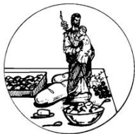
St. Joseph Table

As we begin our season of fasting, prayer, and almsgiving, the reading from Deuteronomy reminds us of our duty of almsgiving, that we “set [our offerings] before the Lord, [our] God, [and] shall bow down in [God’s] presence” (Deuteronomy 26:10). The reading from Romans refers us to our prayer, reminding us that “The word is near you, in your mouth and in your heart . . . For everyone who calls on the name of the Lord will be saved” (Romans 10:8, 13). These are comforting words, and encourage us to ask God for what we need and to aid us in our prayer. Finally, the Gospel of Luke shows us a fasting Jesus, who was tempted as we are, and who knows what it means to be human. Someone once said that temptation arises when you’re tired and weary, and the devil comes along and makes a perfectly reasonable suggestion. Jesus shows us that, with his help, we too can overcome our temptations, reasonable as they may sound