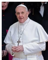
Name of our Pope Pope Francis I