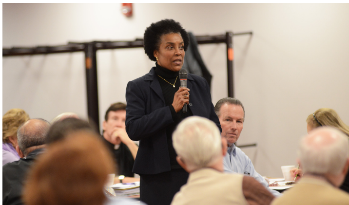
Lots of questions and lively discussions surfaced during the Faith In Our Future Cohort training sessions held in mid-March throughout the four-county Diocese. Here, a Burlington County parish core team member takes the microphone during the session held in St. Isaac Jogues Parish, Marlton. For full coverage of this training session, visit TrentonMonitor.com and click on NEWS>OUR DIOCESE .

The 20 or so members of the Planning Commission are priests, deacons, women religious, and lay men and women from all four counties of the Diocese who have been identified because of their experience in the